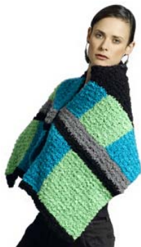
Color Block Wrap Pattern Kit