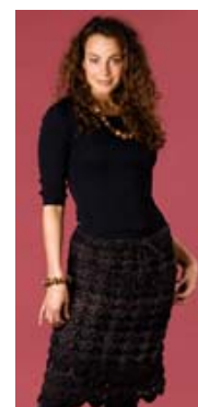
Simply Soft Shadows Openwork Skirt