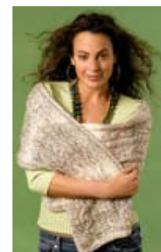
Simply Soft Shadows Cabled Wrap