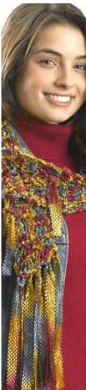
Make this quick and easy scarf with Pizzazz™, another great fashion yarn from Caron!

Welcome to Caron Connections, your free e-newsletter from Caron International.