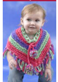
Simply Soft Quick Baby Poncho