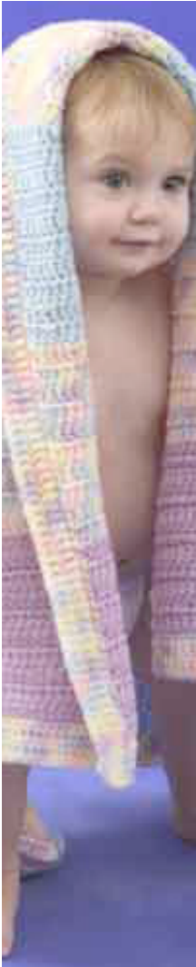
Baby your baby even more with this sweet, soft and simple crocheted blanket. (click image for FREE instructions)

Issue #19 / Printer Friendly pdf version