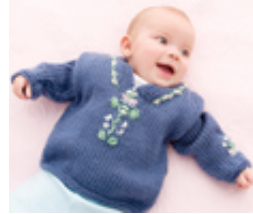
Baby Folkwear Caftan (knit)