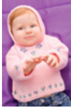
Perfect Posy Hoodie (knit)