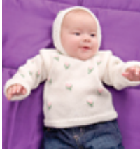
Baby Rosebud Hoodie (knit)