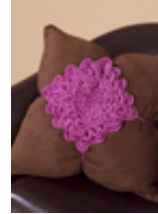
Multi Petal Flower (crochet)