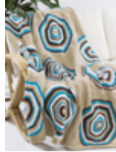
Circle Retro Throw (crochet)