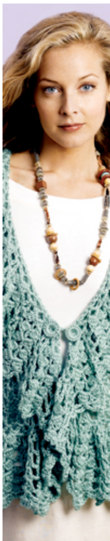
Summer and Simply Soft make a great combination for the softest, laciest looks. (click image for FREE instructions)

Issue #20 / Printer Friendly pdf version