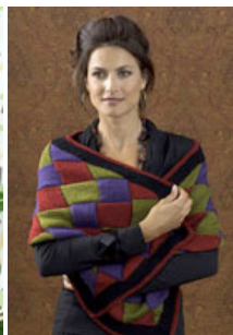
Santiago Entrelac Wrap knit in Country