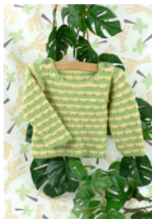
Devon Striped Baby Sweater crocheted in Spa

W e want to help you start the new year with lots of options for creativity. So today, we're bringing you 8 new projects using NaturallyCaron.com Country and Spa. Happy Knit & Crochet New Year!