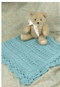
Mayflower Baby Blanket crocheted in Spa