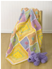
Circles, Stripes & Squares Baby Blanket crocheted