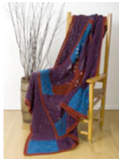
Spider Stitch Throw crocheted