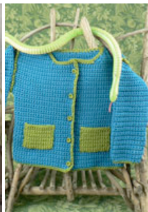
Bozeman Baby Jacket crocheted in Country

W e want to help you start the new year with lots of options for creativity. So today, we're bringing you 8 new projects using NaturallyCaron.com Country and Spa. Happy Knit & Crochet New Year!