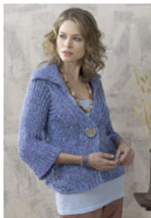
Mumbai Cardigan knit in Spa