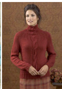
Juneau Pullover knit in Country