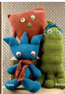
Panama Dolls crocheted in Country