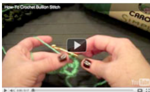
Watch Vickie demonstrate the bullion stitch

Hey there! Last week we shared the pattern for my Whirlwind Wrap from the most recent, Simply Soft® ad. This week, I uploaded a video tutorial on the Bullion stitch you'll use when crocheting this project. Click on over to the Caron blog to watch & learn!