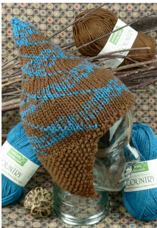
Get Free instructions | Denver Hat

Day Two: While this absolutely darling peaked hat may look like intarsia, it isn't! Fun to make and super fun to wear, the Denver Hat is knit in two colors of NaturallyCaron.com Country yarn. The merino wool blend ensures that the hat will keep you warm, but the blend means it's machine washable, too.