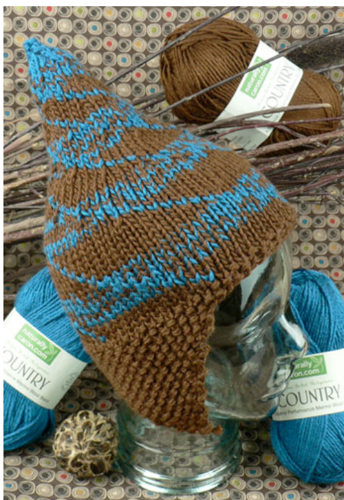
Get Free instructions | Denver Hat

Day Two: While this absolutely darling peaked hat may look like intarsia, it isn't! Fun to make and super fun to wear, the Denver Hat is knit in two colors of NaturallyCaron.com Country yarn. The merino wool blend ensures that the hat will keep you warm, but the blend means it's machine washable, too.