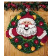
Santa Wreath Latch Hook Kit