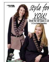
Style for You Booklet