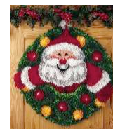
Santa Wreath Latch Hook Kit