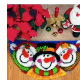
Merry Men Latch Hook Kit