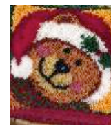
Jingle Bear Latch Hook Kit