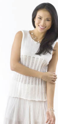
Click to enlarge image