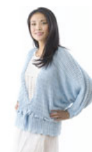
click here for matching Lace Dolman Top pattern