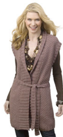
click to enlarge image