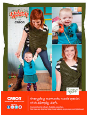
Click to Enlarge As seen in our recent ad